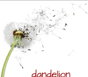
dandelion (blow it out!)