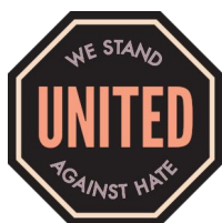
United Against Hate sign