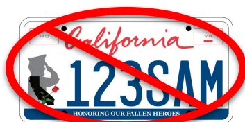
out of state license plate