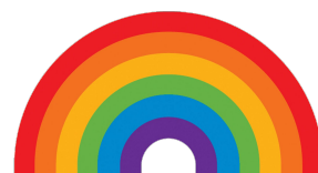
rainbow decoration or flag