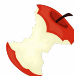
piece of trash (bonus points if you throw it away!)