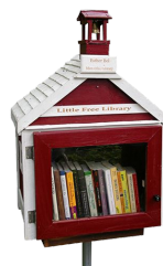
Little Free Library